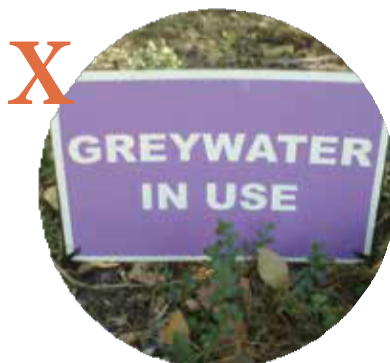
DIAGRAM 3: INCORRECT SIGNAGE WORDING